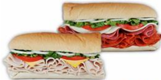
Turkey Sub and Italian Sub

Ham & Cheese Pepperoni & Cheese Oven Roasted Chicken Roast Beef Turkey Tuna Sub Cheese Mix Veggie Sub