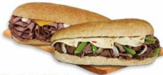
Roast Beef 'N Cheddar and Philly Jack Cheese Steak