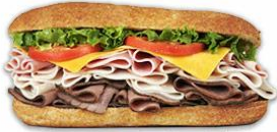
Penny Club on Gold